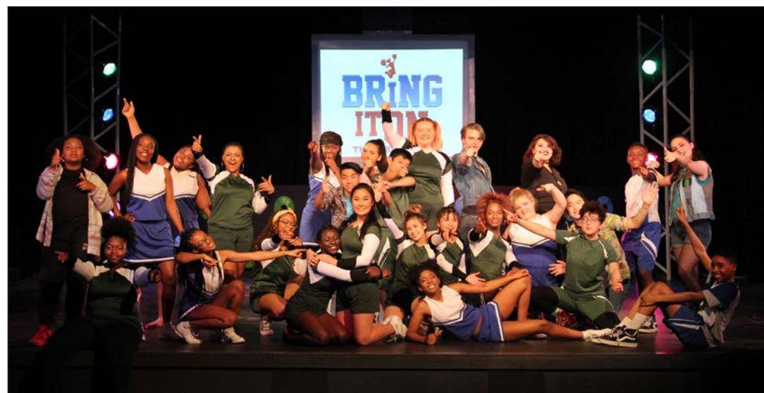
Congratulations to the cast and crew of Creative Arts' production of Bring it On: The Musical for three strong performances April 27-28. Students played leadership roles both on stage and behind the scenes! Thanks to teachers, staff, and parent support that made it all possible!