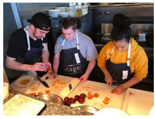
Students work along side professional chefs learning to prepare a roasted beet salad in the kitchen at St. Dinette, recently voted one of the best restaurants in Saint Paul by Mpls. St. Paul Magazine. Students also learned about presentation, a final product below:

Please join us for an evening that celebrates and showcases the fruits of their labor and exploration, as well as supports an incredible school-business partnership that benefits our Creative Arts Secondary School students and community.