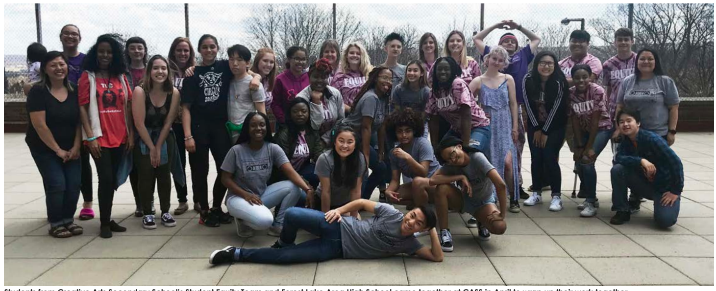
Students from Creative Arts Secondary School's Student Equity Team and Forest Lake Area High School came together at CASS in April to wrap up their work together.