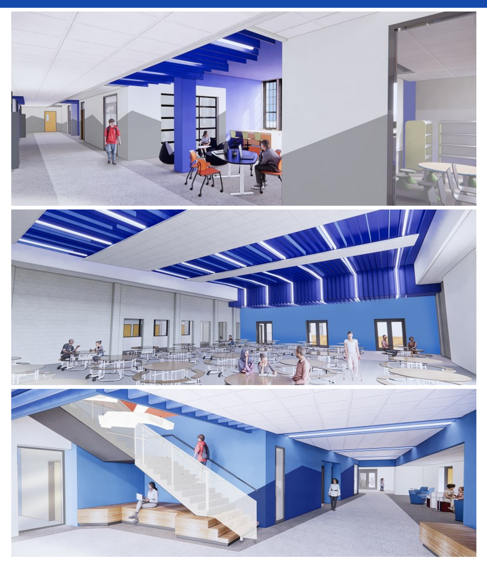
From top: Flexible learning spaces; cafeteria; hallway and staircase