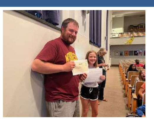
UPCOMING EVENTS >>>

October 17, 2023 Family/Teacher Conferences 4:00pm – 7:00pm