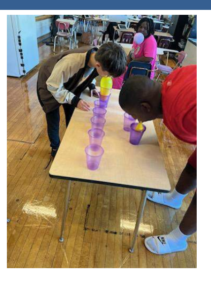
UPCOMING EVENTS >>>

October 2, 2023 Murray PACT Meeting 5:00pm – 6:30pm