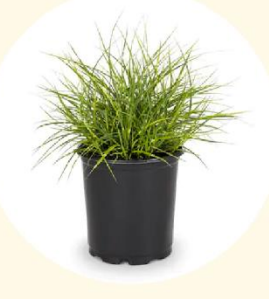
12" GRASS PLANTER