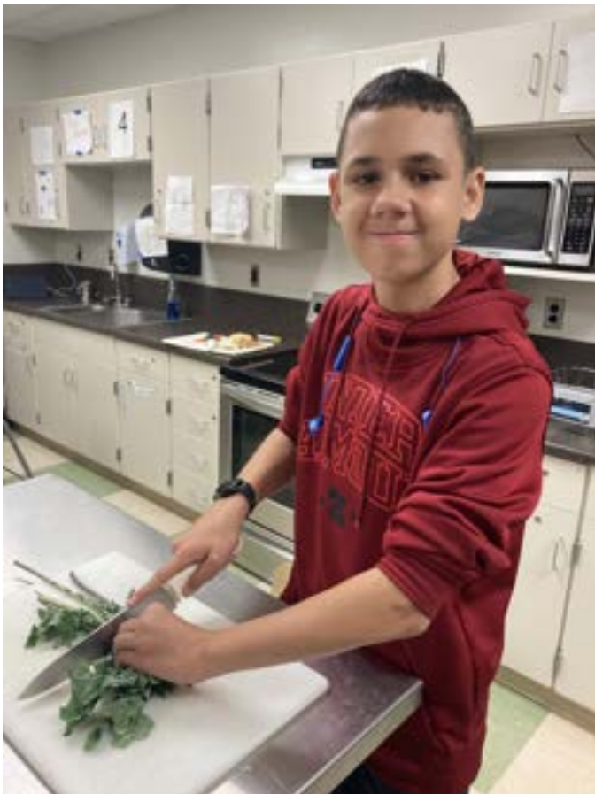
These students are preparing to make a masterpiece in Ms. Gbolo's Culinary Arts class. They are using the vegetables grown in collaboration with Murray Middle School.