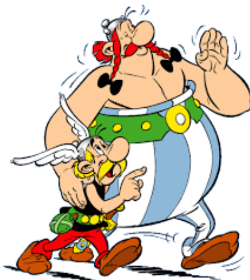
(Astérix et Obélix)