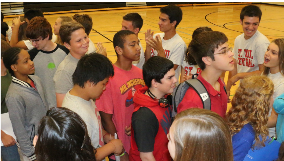
AS HAS BEEN OUR PROCEDURE FOR MANY YEARS, freshmen, welcomed by student leaders, were given an orientation to Central on the Thursday before school began.