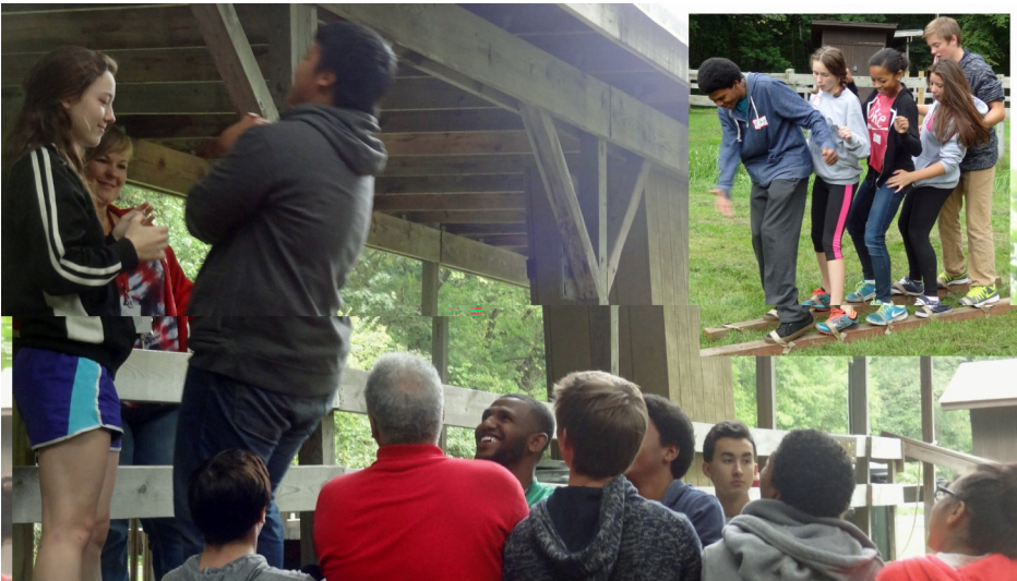
TYPICAL ACTIVITIES at Central's freshmen retreat. Something unusual happened on Wednesday.

FALL MUSICAL: November 14th, 15th, and 16th