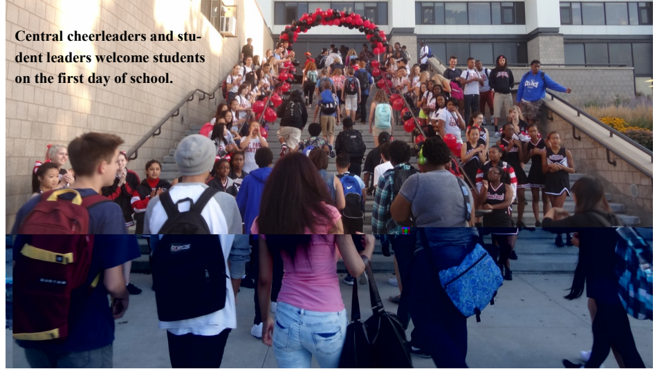
Central cheerleaders and student leaders welcome students on the first day of school.