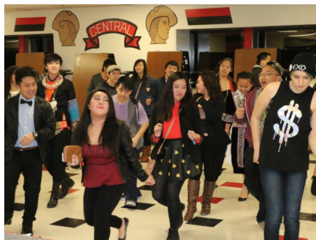
PART OF THE PROGRAM that was billed as "Central Asian New Year 2014" and held January 3rd in Central's cafeteria included models wearing clothing from a variety of Asian cultures (top picture). The evening also included vocalists, musicians, dancers, and dancing by the audience and program participants (lower picture). The event was sponsored by the Central Asian Culture Club.