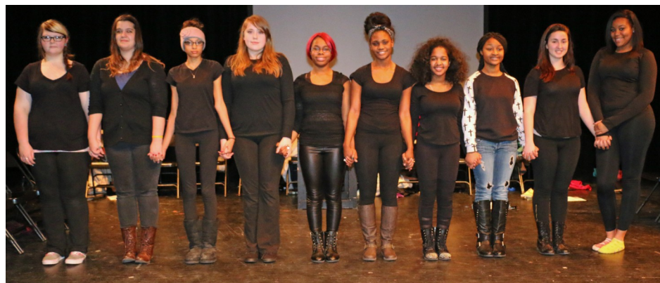
TEN CENTRAL ACTRESSES from the Central Touring Theatre produced a stage version of The Laramie Project on January 10th and 11th in the auditorium. The ten students each played from six to eight roles. The play is about how people reacted to the murder of Matthew Shepard, a gay University of Wyoming student in Laramie, Wyoming, in 1998. Many persons considered the killing to be a hate crime.

SENIOR SNOWTUBING: February 19th at Buck Hill. Cost: $17.