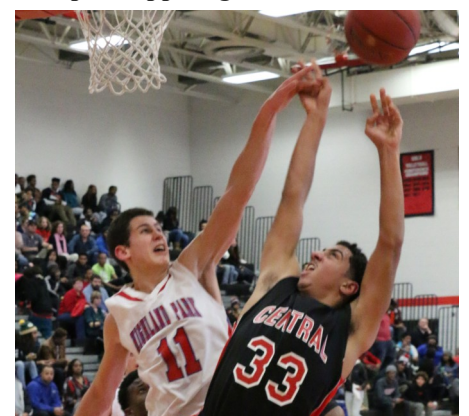
HIGH ENERGY in a win over Highland.