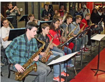
CENTRAL'S TALENTED JAZZ BAND, shown playing here for Central students as they arrived on the last day of school before Winter Break, will provide music for next week's Central Showcase on February 6th. The Showcase, an annual event, is designed to attract new students to Central.