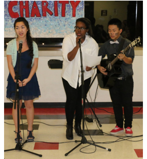
MUSICAL AND DANCE ENTERTAINMENT, as well as a meal, were part of last Friday's Fresh Force "Wish Upon A Charity" event in the Cafeteria. Proceeds were designated for Our Brothers and Sisters Orphanage in St. Paul.