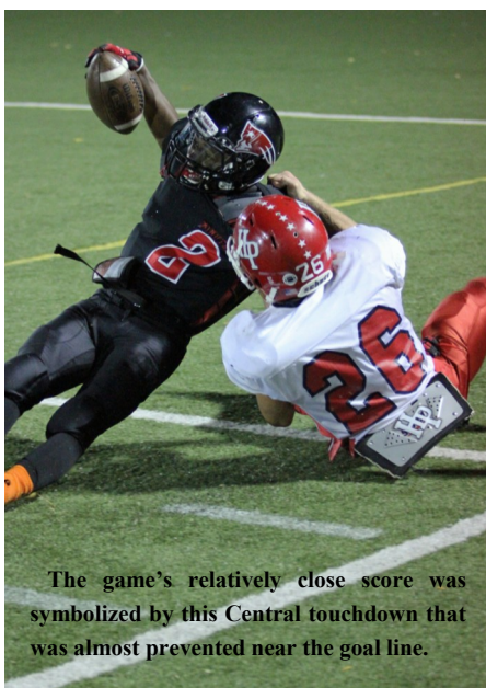
The game's relatively close score was symbolized by this Central touchdown that was almost prevented near the goal line.