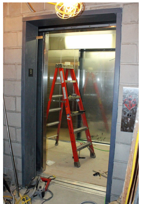
The newest elevator is almost ready.

This year it is slightly different. There is no key and everyone is required to take the stairs, unless they have a note. This should benefit the people who need to use elevators.