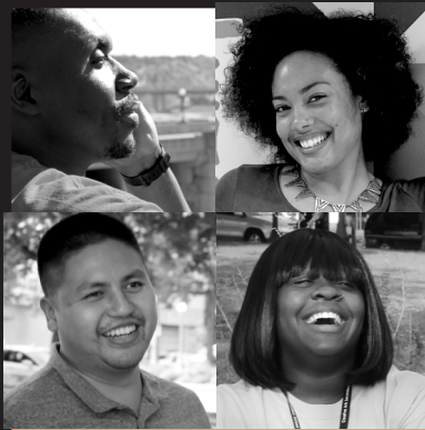
Photograph from the Humans of Creative Arts Exhibit

Even better, tell all your friends about the great, creative work that our students and staff bring into the world at Creative Arts. We're excited to continue this work throughout the year with exhibitions, performances, artist residencies, after-school activities, and even some ideas we haven't discovered yet!