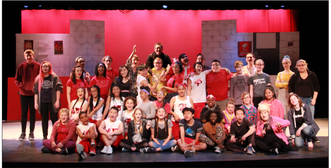
Congratulations to the cast and crew of Creative Arts' production of High School Musical for three strong performances April 28-29. Students played leadership roles both on stage and behind the scenes! Thanks to teachers, staff, and parent support that made it all possible!

After learning a little bit about folk tales in Foundations, and learning how these kinds of stories can help teach us valuable lessons, students spent five days making hand puppets using recycled newspapers, masking tape, and paper maché.