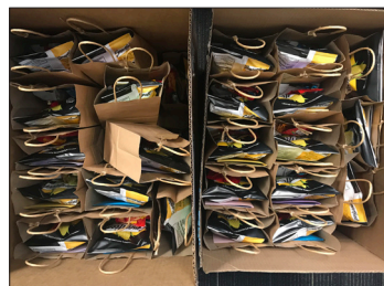
Thanks to the PAC for providing positive messages and treats to teachers for Teacher Appreciate Week!