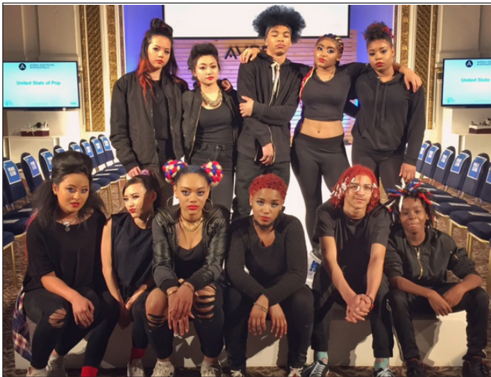
Advanced Dance students performed at the Aveda Institute on Sunday, April 23.

Are you interested in technology? Robots? 3D printing? Come to GeniusCon at Washington Tech on May 13th! Open to everyone, students, adults, and community members. See Genius Squad in the library for more information.