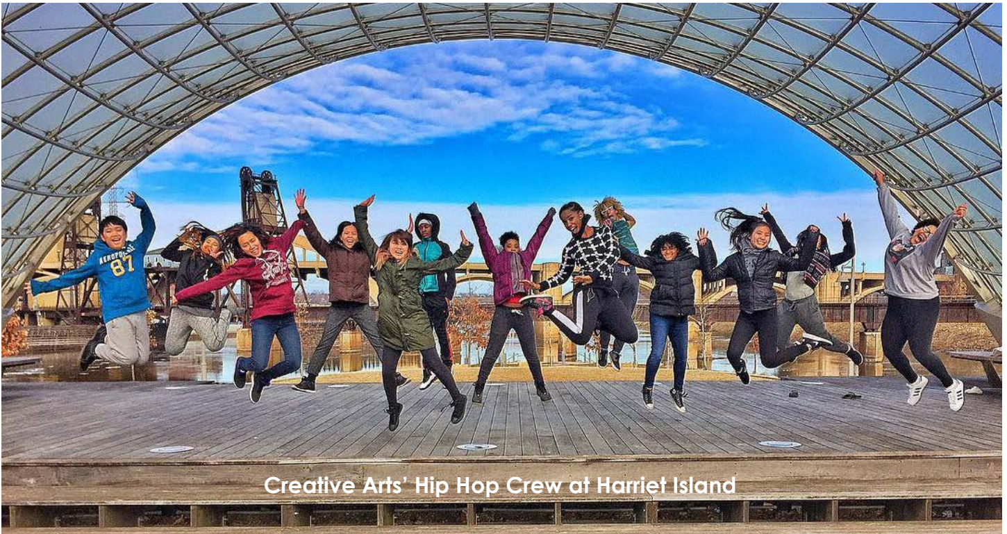
Creative Arts' Hip Hop Crew at Harriet Island