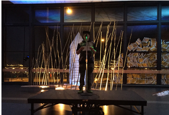
Students read original writings at the Poetics of Forgiveness art opening on December 20.