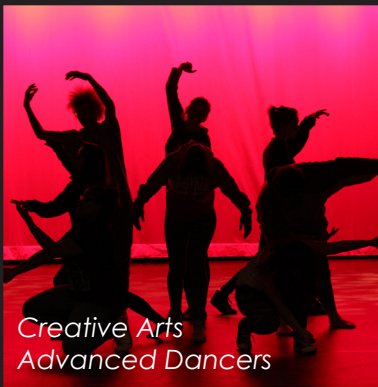
Creative Arts Advanced Dancers

FEBRUARY 2016: News, events, and information for Creative Arts Secondary School