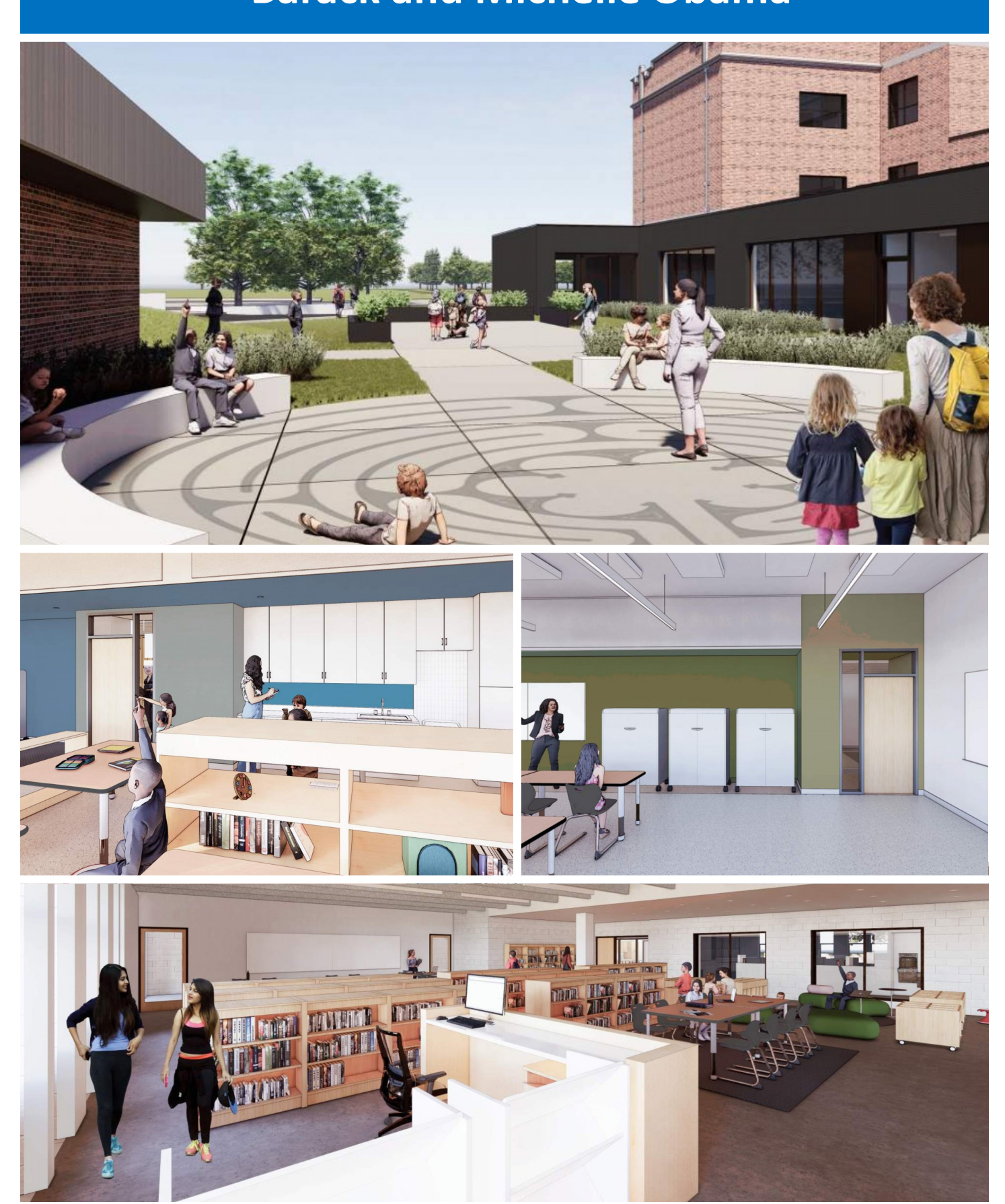
From top: Renderings of outdoor learning space; Montessori Children's House; middle grades classroom; media center