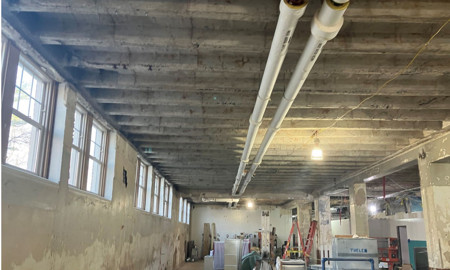
From top: Prepping for concrete; concrete beams on the first floor (November 2023)