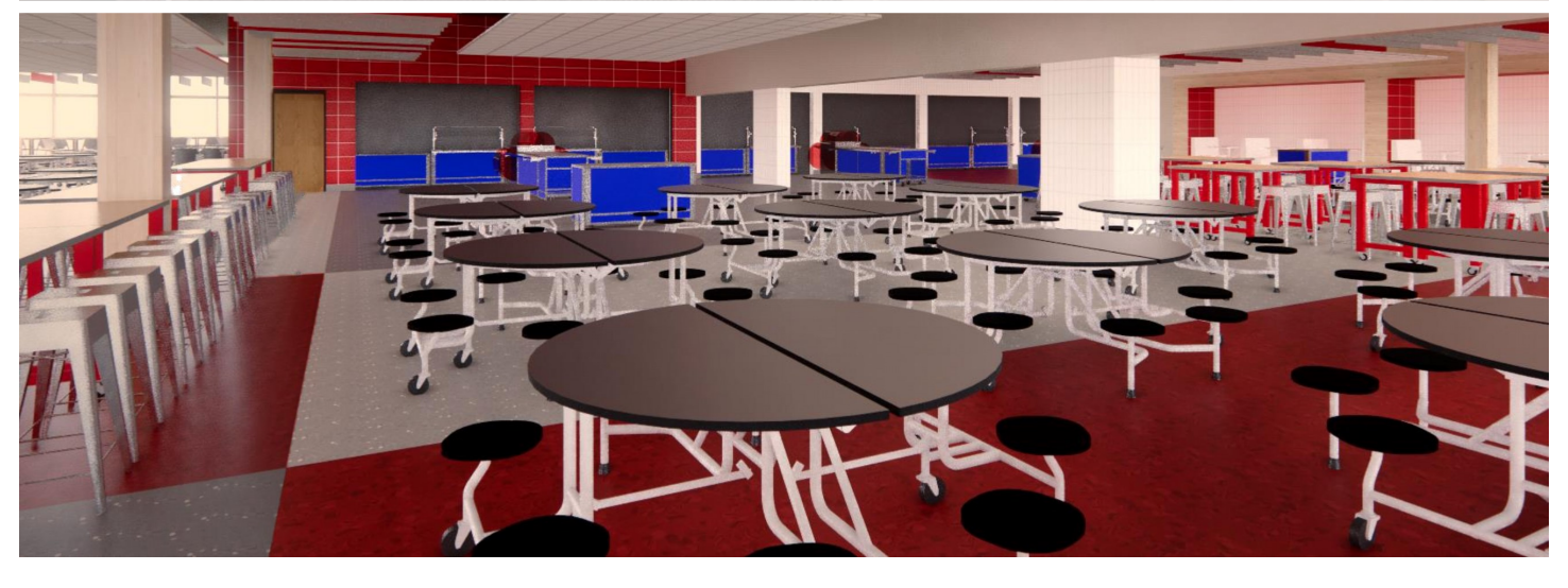
From top: Renderings of reception area, breakout and small-group rooms, and cafeteria