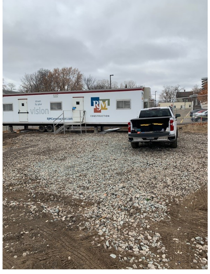
From top to right: Two photos showing drilling for piers; rock to pour into pier wells; site job trailer (November 2023)