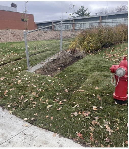
From top left: New café projector; new classroom projector; Tiger's Lair book fair; autumn artwork display; front lot striped for student pick-up/drop-off; new service access with new sod (November 2023)