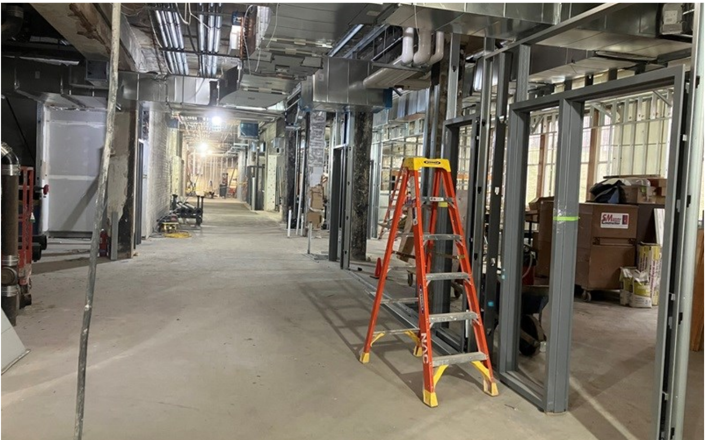
From top: First-floor lightwell; west corridor (December 2023)