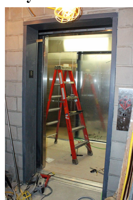
The newest elevator is almost ready

This year it is slightly different. There is no key and everyone is required to take the stairs, unless they have a note. This should benefit the people who need to use elevators.