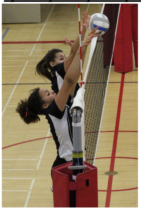
A Few Central Results...