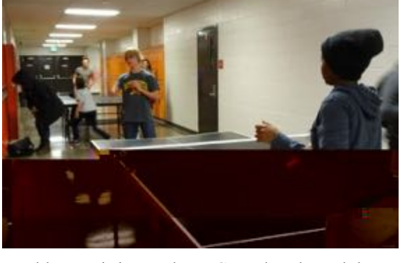
Table Tennis is popular at Central each week by Dr. Mamma's room.

Boys' Basketball 2-7-0 Girls' Basketball 5-4-0 Gymnastics 2-0 Boys' Hockey 7-5-0 Girls' Hockey (Blades) 7-7-0 Boys' Swimming 1-0 Wrestling 8-5-0