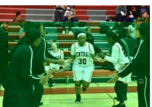
Support your teams!