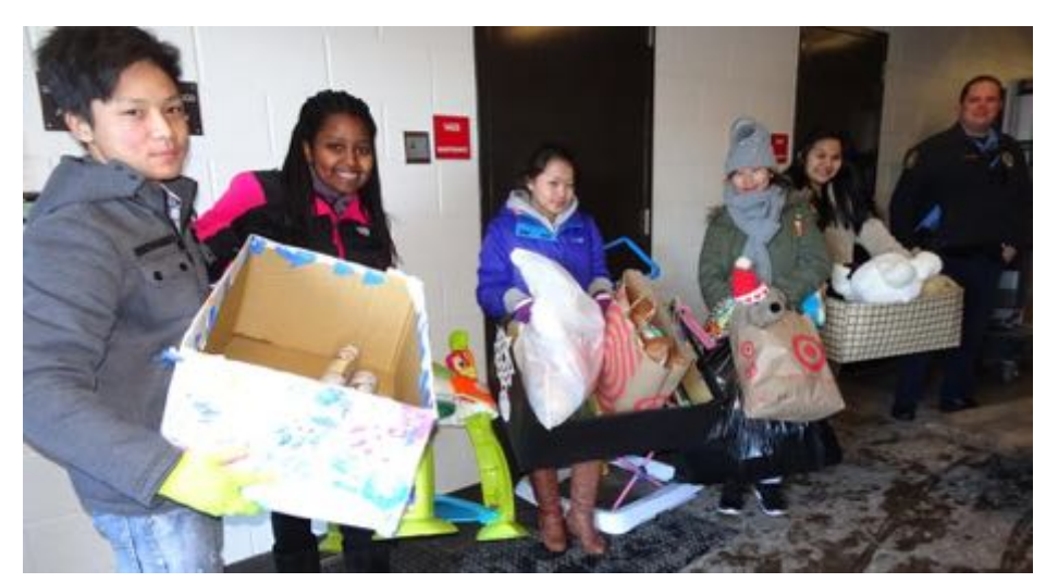
Central students along with the St. Paul Police Dept. collected toys for local families in the Student Council sponsored Toy Drive

Volume 95 Number 4 Saint Paul, Minnesota January, 2017